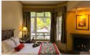
DELTA BANFF ROYAL CANADIAN LODGE