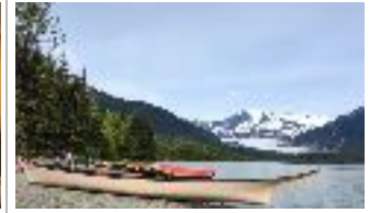
MENDENHALL LAKE IN JUNEAU, ALASKA