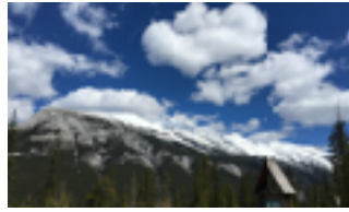
BANFF NATIONAL PARK, CANADA

"We travel not to escape life, but for life not to escape us."